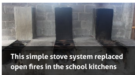
This simple stove system replaced open fires in the school kitchens