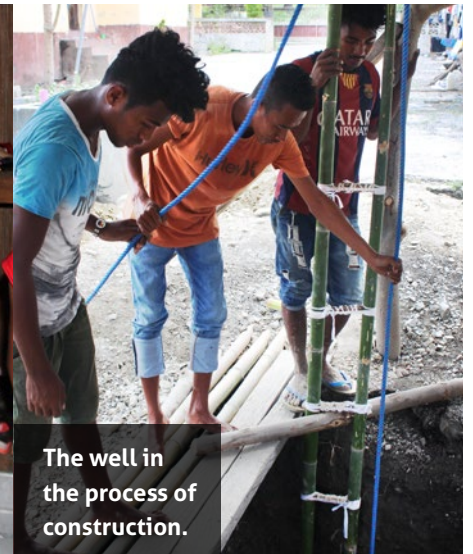
The well in the process of construction.